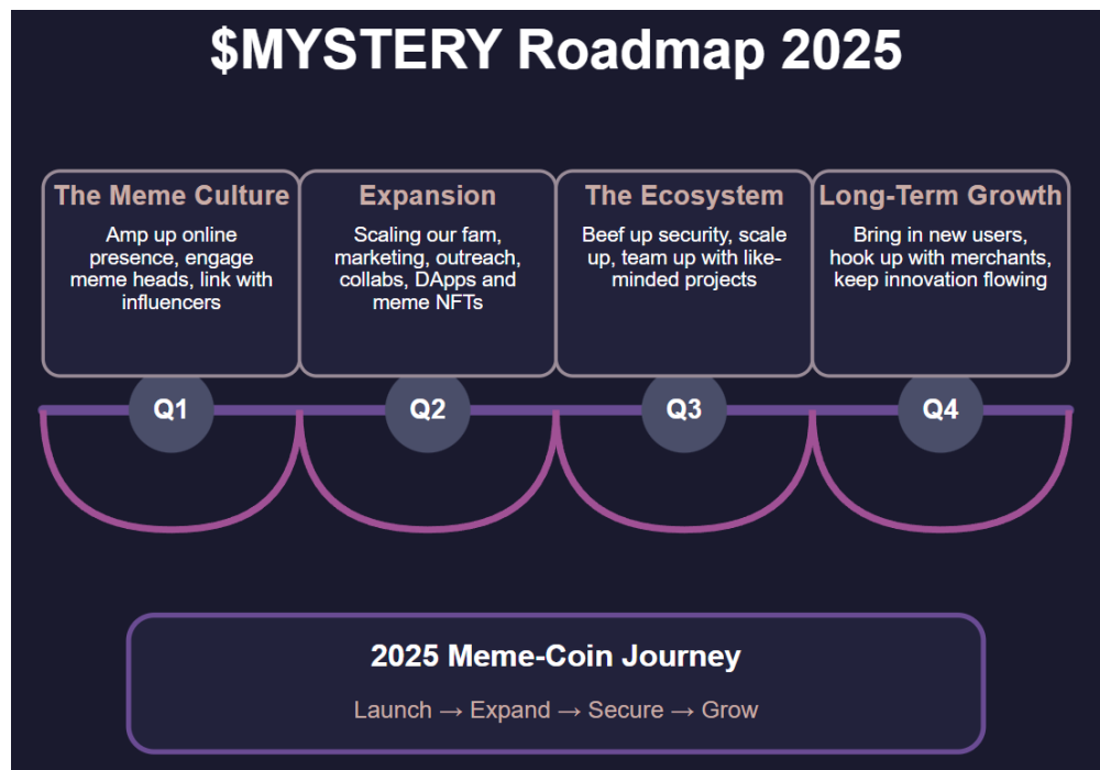
Figure 2: $MYSTERY roadmap overview (Placeholder)

Throughout each phase of the roadmap, the guiding principle is to keep the community at the heart of progress. Milestones are achieved in collaboration with supporters—through beta tests, feedback sessions, and voting on proposals—ensuring that $MYSTERY grows in a direction that its users genuinely want. This iterative, community-first approach makes the roadmap a living document; it can adapt based on input and evolving opportunities, all while maintaining the core vision of a fun, useful, and enduring meme coin project.